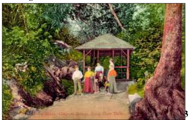
See article on the cover of this newsletter. Hope to see you at the meeting!