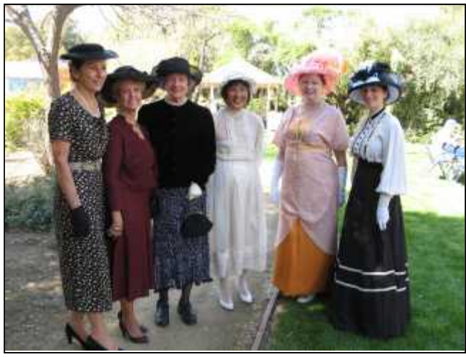
20 costumed historical characters representing those areas will be on hand to tell you their story. Got a

Saratoga has always been a city with talented artists, writers, community leaders, and more. Over