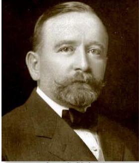
James D. Phelan

In 1864 Congress asked each state to choose two of their most prominent citizens and gift their statue to the Hall. The first statue was placed in 1870. The majority of the states, however, did not take the matter seriously and took their time with their selections. The California Legislature also