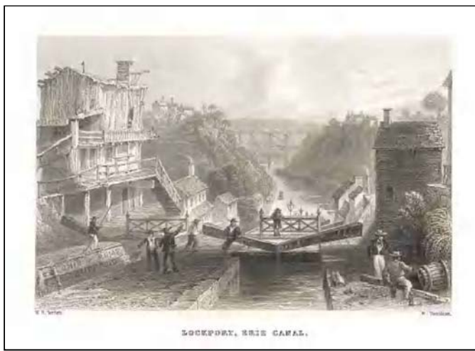
Eighth Wonder of the World

The construction of the Erie Canal, 363 miles long, was completed in 1825 and linked the waters of Lake Erie in the west to the Hudson River in the east.