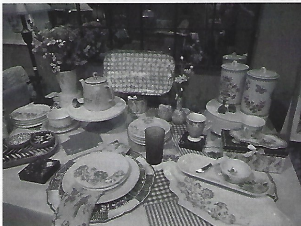
Table setting is a way to set a table with tableware such as utensils for eating and for serving. And, according to Connie, "Set a table properly with lovely table settings can even make the food taste better!"

"I have always enjoyed putting together unique place settings-- combining lovely antique dishes with new", says Connie. "I like to put together different linen textures using a broad palette."