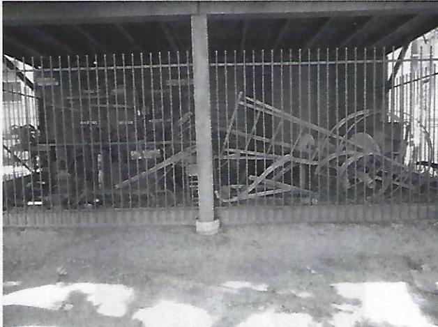
Plans for the new exhibit: